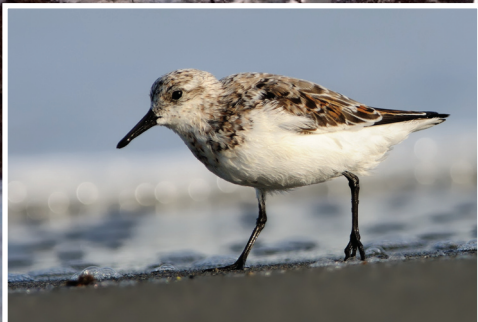
This is a sanderling.

Look, I can see sanderlings. They are gathering together on the sand and the rocks.